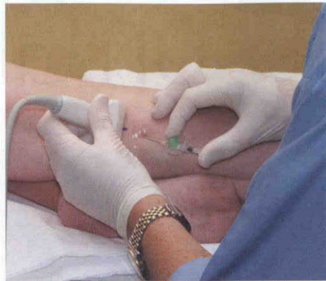
About 20ml of foam can be injected over a period of 20 to 30 minutes

ted into the saphenous vein under ultrasound control.