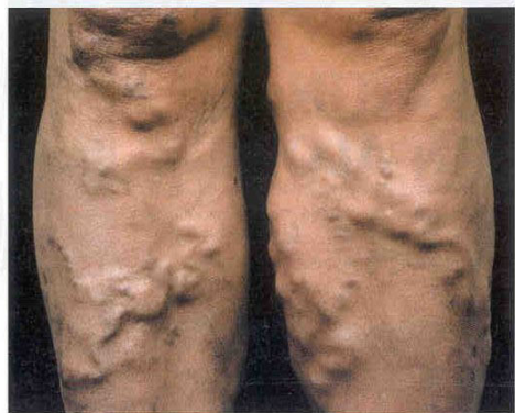
Visible varices can be treated effectively using foam sclerotherapy